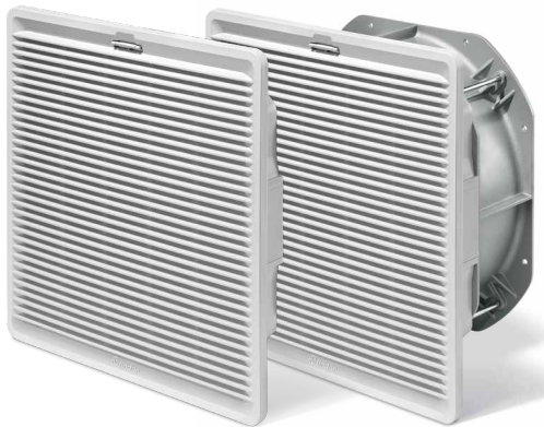
Type 7F.2x.8.xxx.5550 Type 7F.2x.8.xxx.5700