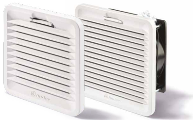
Type 7F.2x.x.xxx.1020 Type 7F.2x.x.xxx.1020 Type 7F.2x.x.xxx.2055 Type 7F.2x.x.xxx.3100