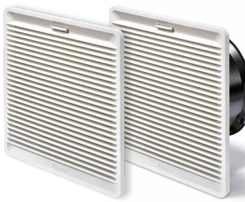
Type 7F.2x.x.xxx.4250 Type 7F.2x.x.xxx.4400